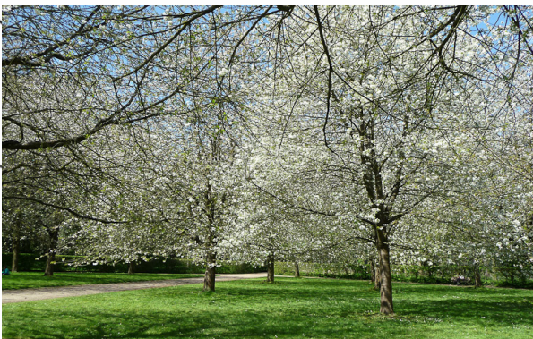
Proposed tree (Prunus avium 'Plena')