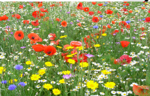
Wild flower meadow (Local Authorities Double Delight Seed Mix)

NOTES: 1) A POWER SUPPLY TO BE INSTALLED TO THE NEW SEATING AREA FOR FUTURE EVENTS. 2) NEW 150MM DIAMETER SPARE DUCTING TO BE LAID FOR FUTURE WIFI REQUIREMENTS AND OTHER FUTURE UTILITY REQUIREMENTS.