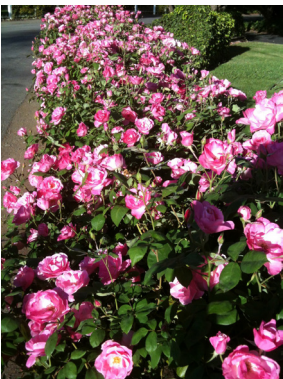
Informal hedge (shrub rose)